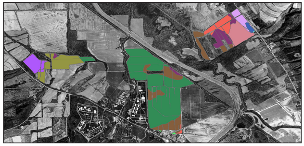
Figure 1: Variability of soils was mapped using aerial photographs and soil survey data.

Precise estimation of corn nitrogen (N) needs has been difficult due to many interacting and complex processes that affect N in soils and crops. Over the past years, we developed the Web-based Adapt-N tool to provide improved in-season N recommendations based on model simulations of soil N dynamics and corn N uptake. The tool is currently available for farms in the Northeast and lowa, and will be expanded for use in the entire eastern USA for the 2012 growing season. Adapt-N is built around the powerful Precision Nitrogen Management (PNM) model, which uses information of soil and