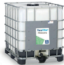
Delivered to retailers as liquid-coating.

The information provided is accurate to the best of Yara's knowledge and belief. Any recommendations are meant as a guide and must be adapted to suit local conditions.