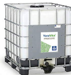
Delivered to retailers as liquid coating

Yara Canada, Inc. 800-667-7255 www.yaracanada.ca