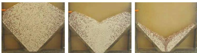
Poor quality blends segregate during handling

Many soils are low in micronutrients and it is common to add Zn, Mn, Cu, and B into dry fertilizer blends applied pre-plant or at planting. Common options for micronutrients involve applying them as dry sulfates such as ZnSO 4 or MnSO 4 . The rate that the micronutrients are applied in the blends is a small percentage compared with the volume of the entire blend. Due to the relatively small amount of micronutrients, varied granule size and density, segregation often occurs resulting in uneven distribution of the micronutrients in the blend and across the field which translates to inefficient feeding by the crop.